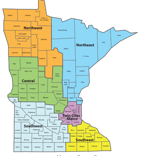
MINNESOTA BUSINESS COMMUNITY DEVELOPMENT REGIONS